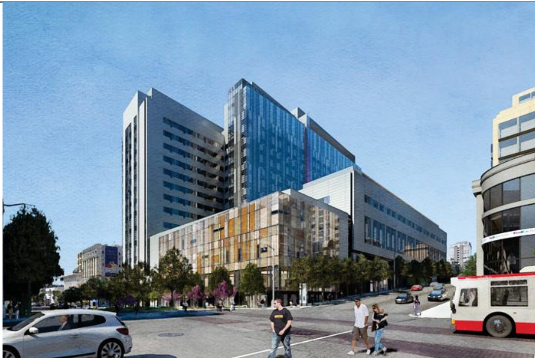
Figure 3: Cathedral Hill Hospital, San Francisco (USA)